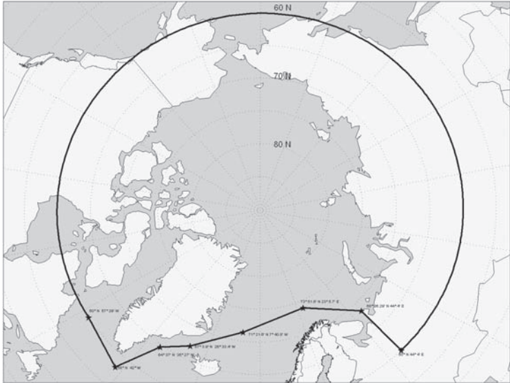
Figure 1 – Maximum extent of Arctic waters application (see paragraph G-3.3)*