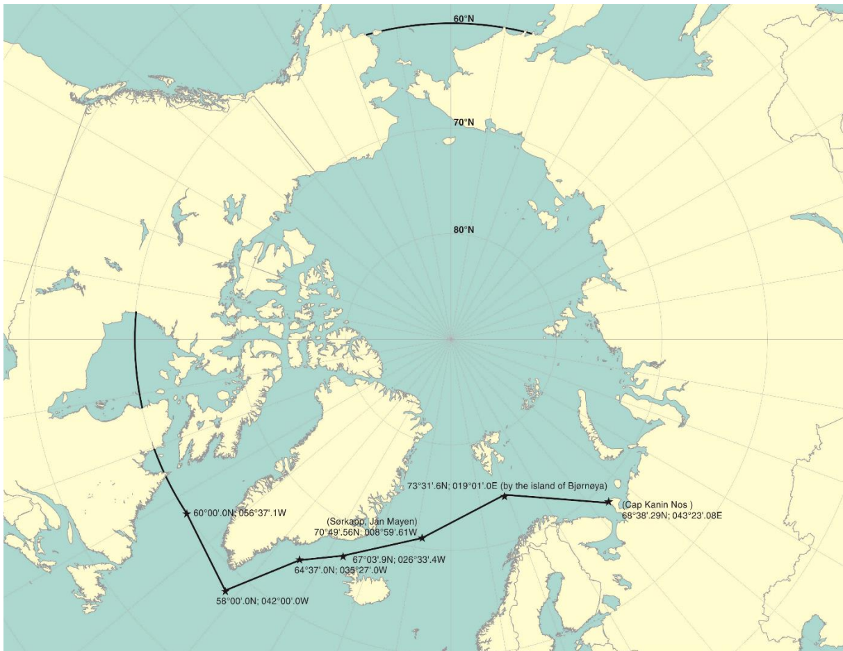
Figure 2 – Maximum extent of Arctic waters application 3